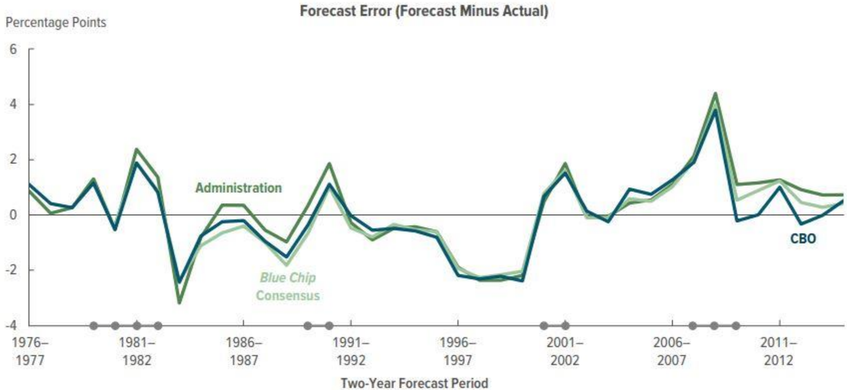
Illustration: The Accuracy of CBO's Projections of Growth in Inflation-Adjusted Output

Congressional Budget Office, CBO's Economic Forecasting Record: 2017 Update (October 2017), Figure 7, www.cbo.gov/publication/53090 .